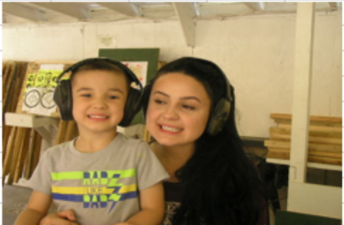
Young mom with 5yr old son.