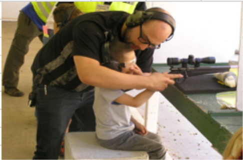
Teaching INDEXING can be painful.