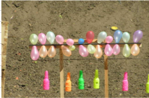
Rubber balloon rack. Final version.