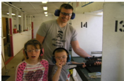
Showing off his favorite bullet.