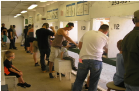
Shallow side almost full.

Every rifle got a good work out. We are now looking at adding two more.